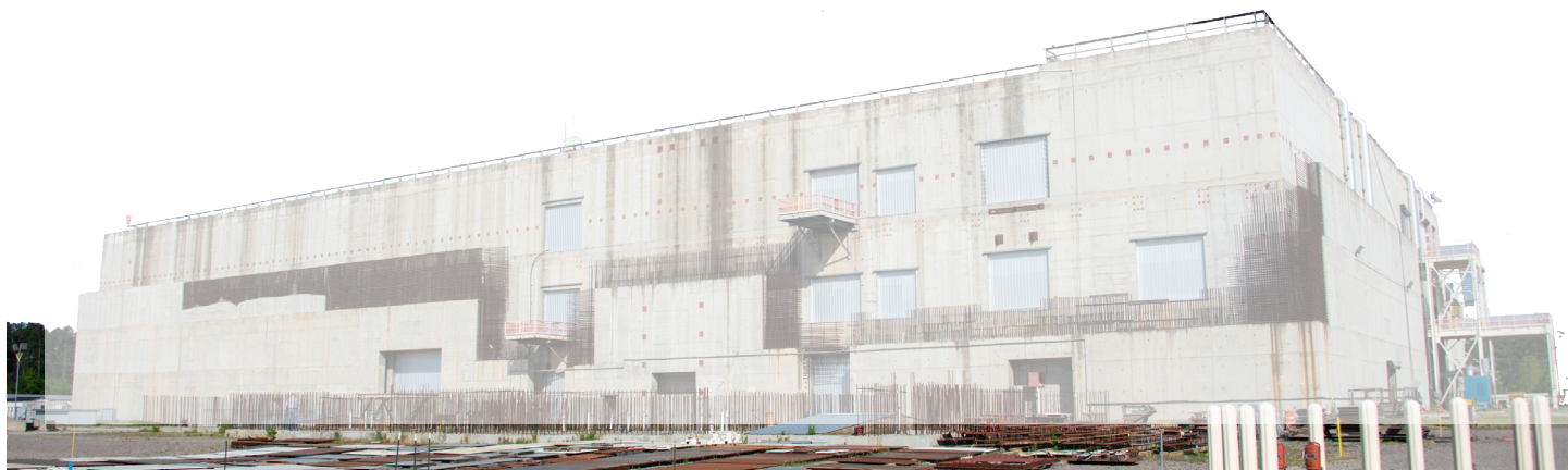
400,000 sq. ft. of available Hazard Category-2 space

Repurposing the MPB requires modifications and installation of manufacturing and support equipment directly associated with the pit production mission. Preparations at SRS will also include removing some existing facilities, along with adding new support facilities and modifying some existing ones.