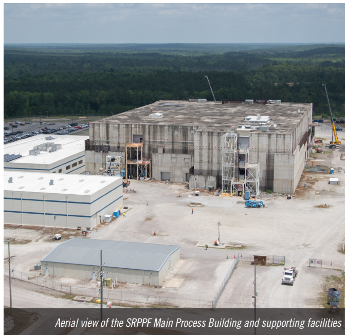
Aerial view of the SRPPF Main Process Building and supporting facilities

In October 2022, SRNS entered into a Project Labor Agreement with the Augusta Building and Construction Trades Council, which is comprised of 19 local unions. The agreement is in support of construction of the SRPPF, as there are approximately 4,000 construction and trade union jobs to fill for the entire project.