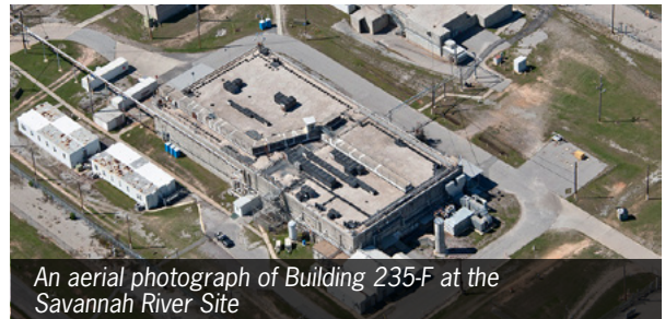
An aerial photograph of Building 235-F at the Savannah River Site

Long-term, deep-space missions — such as Galileo, Ulysses, and Cassini — used SRS Pu-238 to generate electrical power needed to operate the instruments on board the spacecraft, such as operating cameras, collecting data and relaying information to the earth.