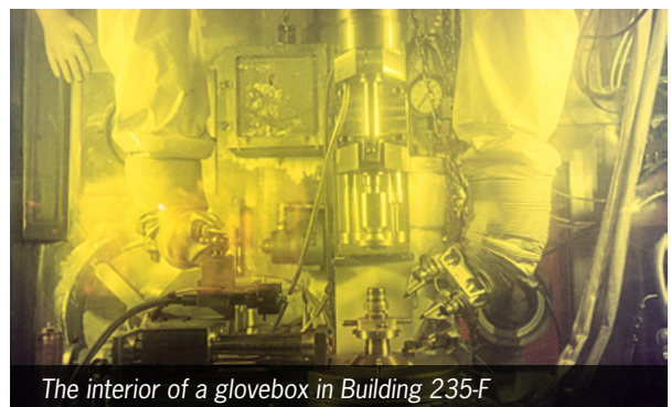
The interior of a glovebox in Building 235-F